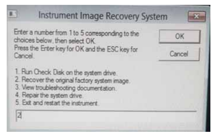
Figure 2-1 System recovery selection screen

Step 6. Type 2 to select Recover the original factory system image option and press [Enter].